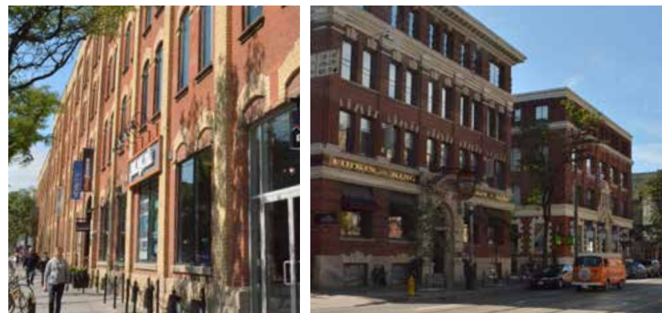
PICTURED ABOVE: King Street West neighbourhood