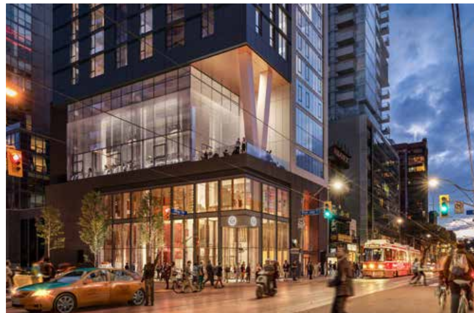
PICTURED ABOVE & ON COVER: Artist's rendering of corner of King St. West and Blue Jays Way.