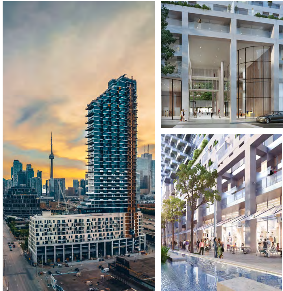
COVER: Western elevation. LEFT: Eastern elevation. TOP AND BOTTOM RIGHT: Artist's renderings of completed retail, western elevation.