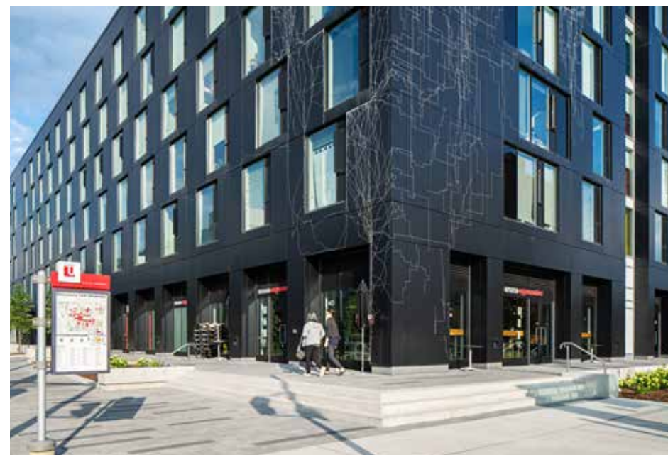
PICTURED ABOVE: Aroma Espresso Bar in building C1 PICTURED ON COVER: East Elevation of building C2