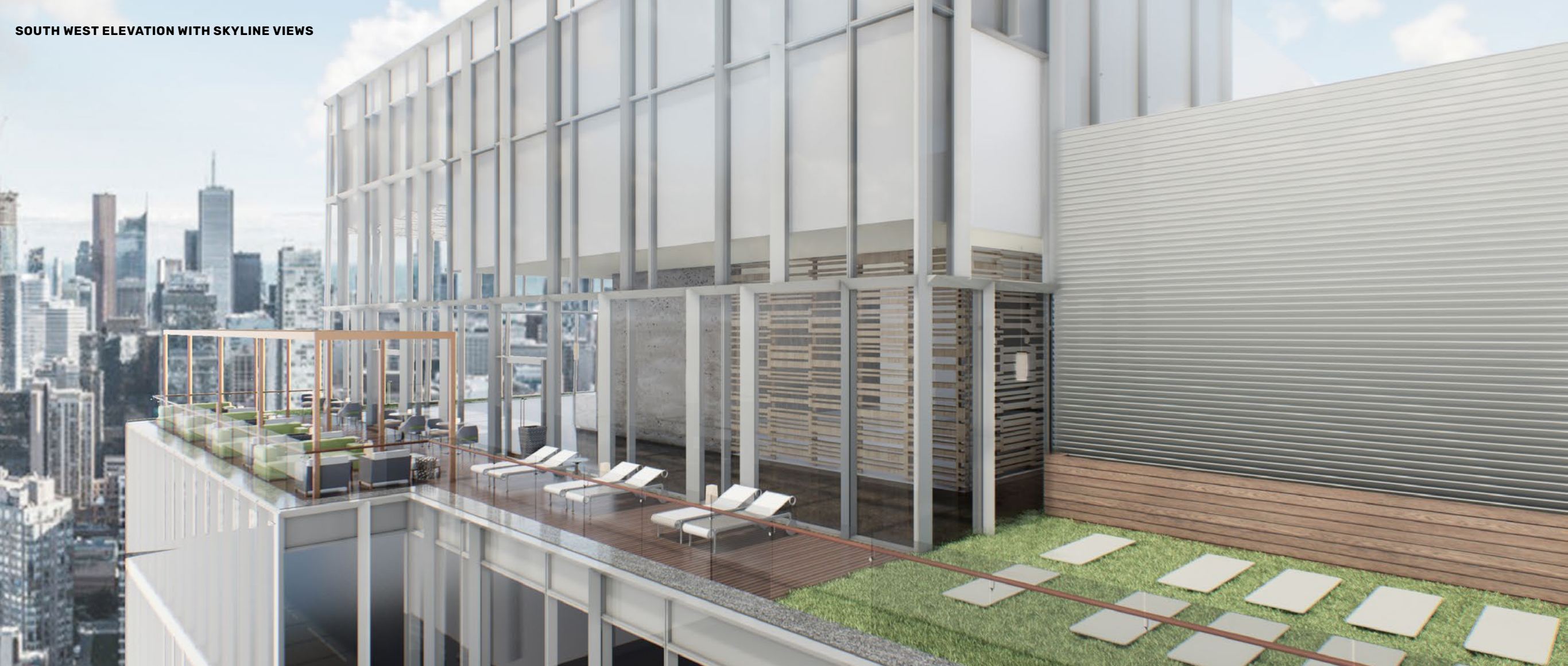
SOUTH WEST ELEVATION WITH SKYLINE VIEWS